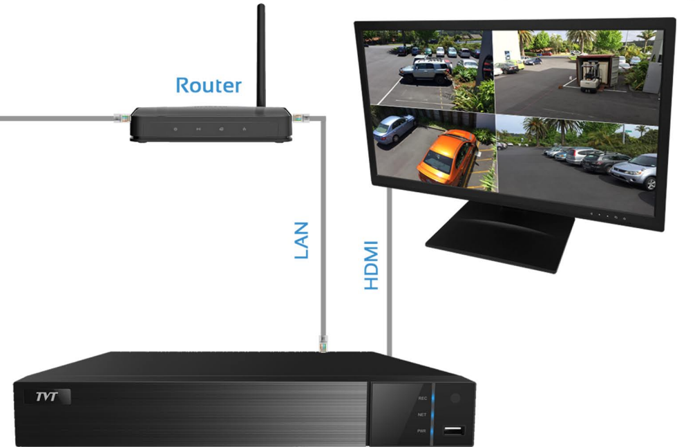
TVT-8CHNVR-P (8 Channel NVR)